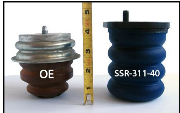
Comparison OE and SSR-311-40