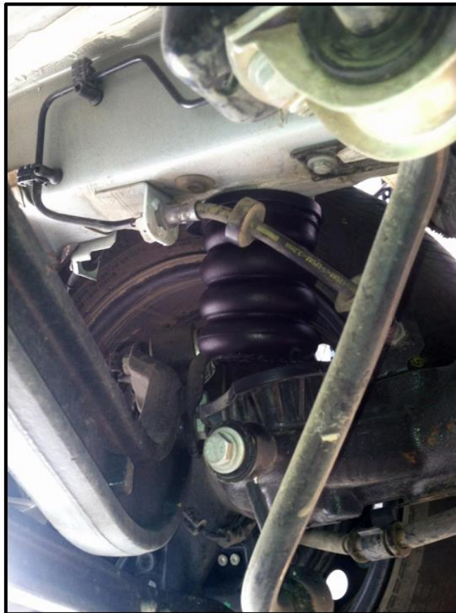
Installed off the ground